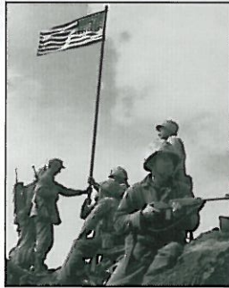
The first flag raising over Iwo Jima. 10 a.m., Feb. 23, 1945